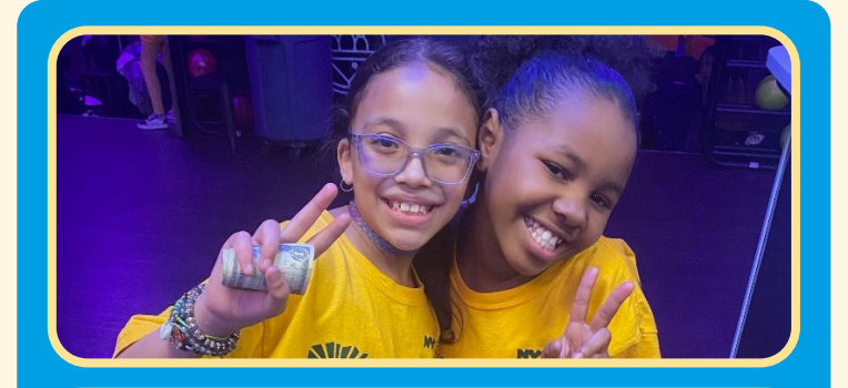
Multicultural After-School Program (MASP) (grades 1-5)