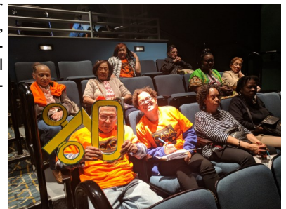
Bronx Public Hearing of RGB

Because of the testimony from CASA and other tenant groups across the city, the RGB voted for a 1.5 % increase for 1 year leases and 2.5 % increase for 2 year leases.