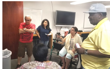
CASA exchange with Brooklyn tenants

and take bold action, like rent strikes or 7A cases, knowing that attorneys will have our backs! This law will be in full effect in 2022. In May, members of the housing court campaign met with tenants from Brooklyn who also have been working for years to reform housing court and agreed to