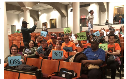
Preliminary Hearing of RGB