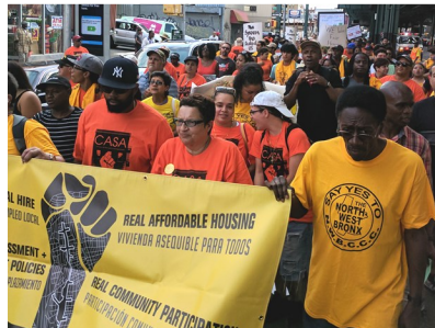
Rezoning March on Jerome Ave