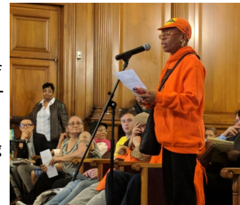
Bronx Borough President's Hearing

The City is moving forward with the same plan which will be voted on early next year. At our November meeting, members voted on new priorities to help us win real affordable housing, anti-displacement policies, good jobs and local hire, and real community participation. This year is an incredibly important year for us to fight even harder to make sure the plan works for us!