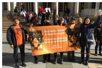
Stabilizing NYC Press Conference

CASA and other members of the Stabilizing NYC Coalition helped pass legislation to create a watchlist of landlords who use predatory practices to target tenants. The list is part of the campaign to take on landlords who buy up buildings and aggressively push out tenants through harassment for financial motives. To take them on, CASA helped form a Bronx Tenant Union!