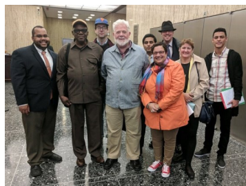
No More MCIs Tenant Coalition