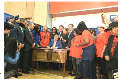
RTC Bill Signing in the Bronx

Tenants and advocates from the Right to Counsel Coalition joined CASA at City Council on July 27th to witness history as City Council voted nearly unanimously for Right to Counsel. On August 11th, Mayor de Blasio signed Right to Counsel into NYC law here in the Bronx to commemorate the hard work of Bronx tenants to make this moment possible.