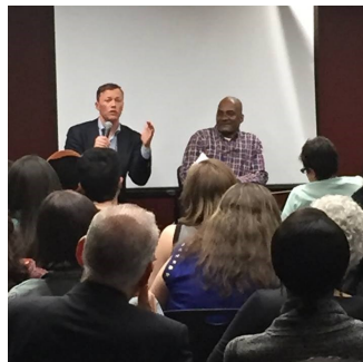
Evicted Book Event