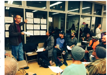
March Rezoning Campaign Meeting