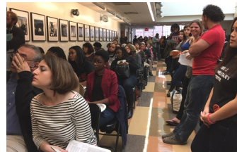
Bronx Gentrification Conference