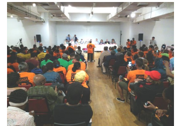
Bronx Public RGB Hearing

for another historic Rent Freeze for the second year in a row for 1 year leases and 2% increase for 2 year leases!