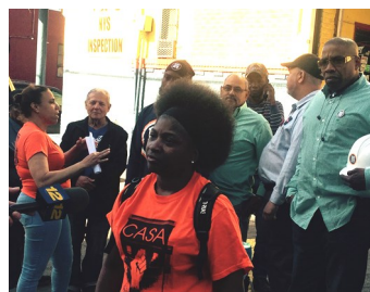
Tour of Jerome Ave with Bronx News 12

We continue to meet monthly to strategize. From April-June, more than 300 people have attended an event about the rezoning, including a Teach-In on Local Hire, a Film Screening about Gentrification and a Policy Briefing for Bronx Non-Profits.