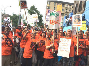
Marching to Bronx Public RGB Hearing