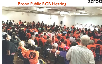
Bronx Public RGB Hearing

CASA mobilized close to 500 Bronx tenants who demanded a rent reduction at the Bronx Public Hearing of the Rent Guidelines Board (RGB) on June 16th. At the hearing, tenants testified on how much of their family's income goes towards paying rent and how rents have gone up while wages have not.